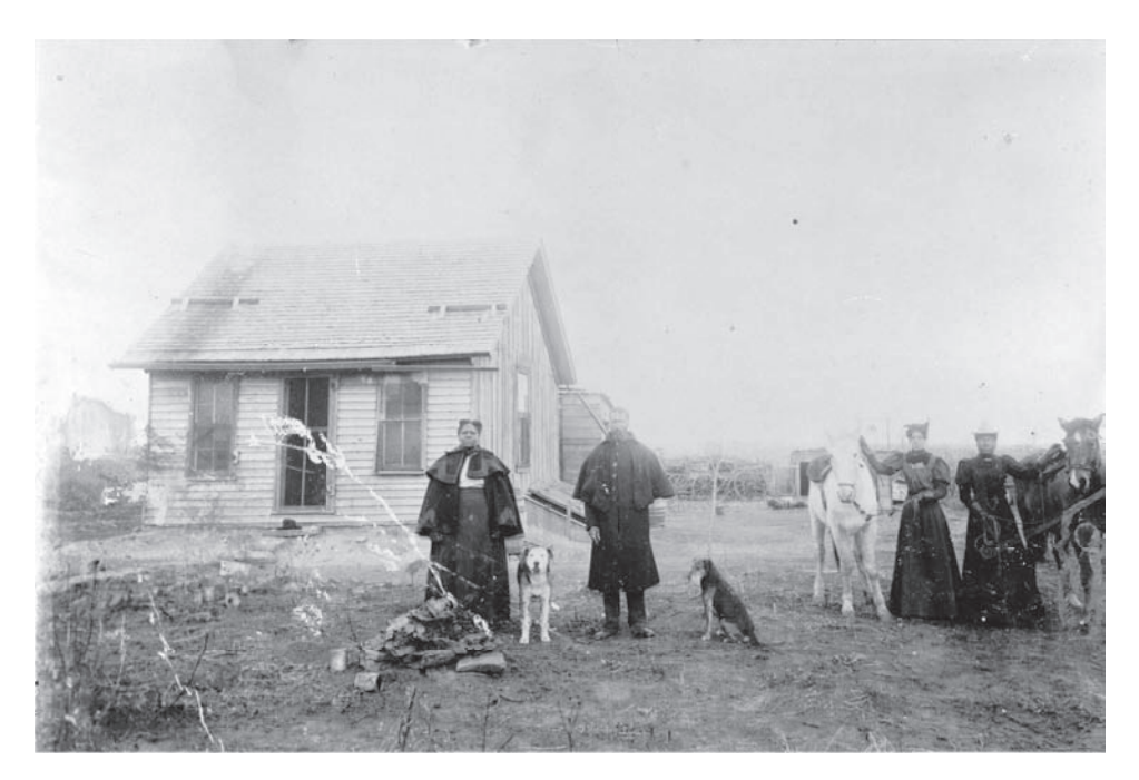
FIGURE 1.5 ► Prosperous African-American settlers in Nicodemus, Kansas, 1877.