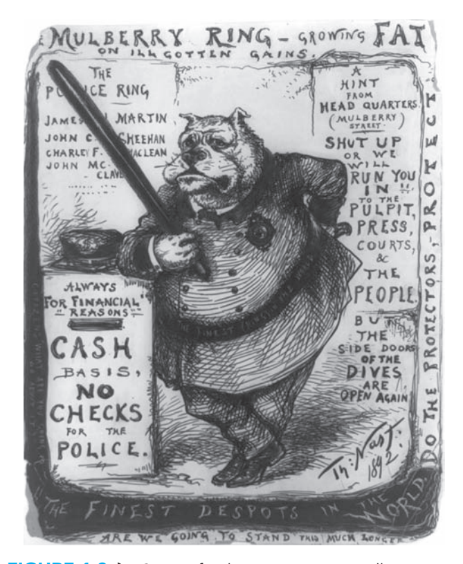
FIGURE 1.2 ► Satire of police corruption. "Mulberry Ring" refers to the New York City Police Department, then located at 300 Mulberry Street. (Library of Congress Prints and Photographs Division [LC-USZ62-85436])

Factors contributing to the settlement of the West included the discovery of gold at Sutter's Mill, California (1848), the availability of tracts of land to settlers under the Homestead Act (1862), and the