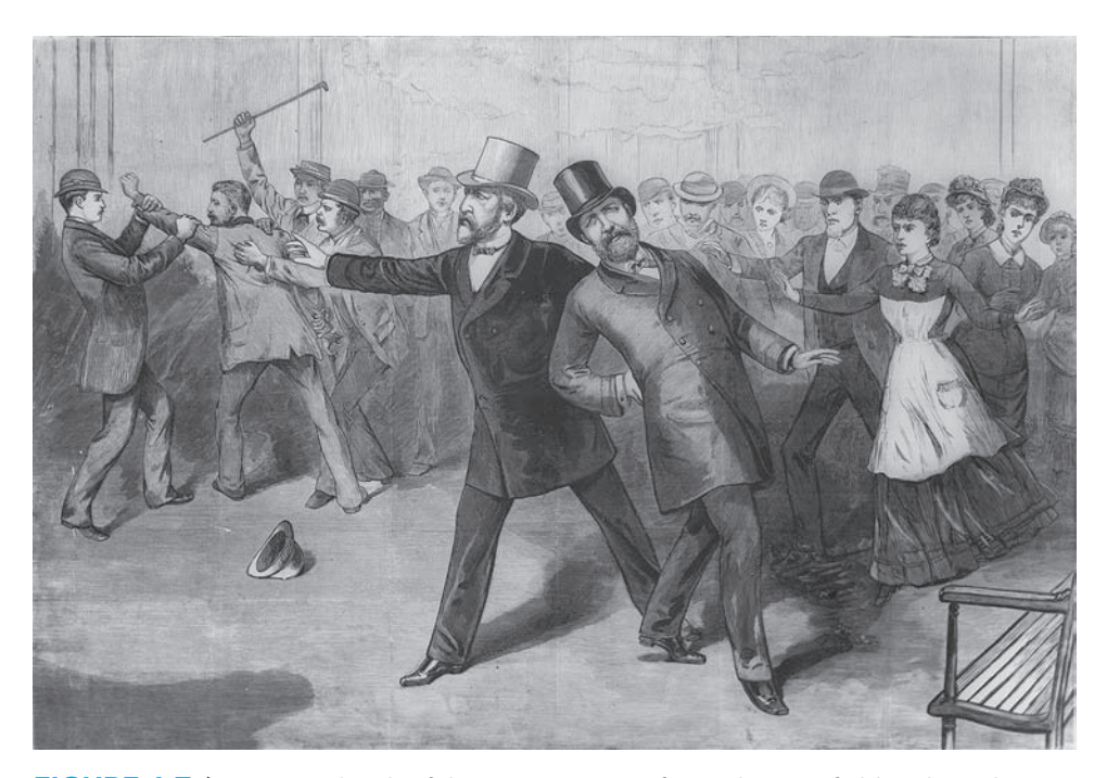
FIGURE 1.7 ► Artist's sketch of the assassination of President Garfield at the Baltimore and Ohio train station in Washington, DC. His assassin is being apprehended in the background. (Library of Congress Prints and Photographs Division [LC-USZ62-7622])

Under the 19th-century patronage system, a person seeking employment in a police department usually needed a letter of endorsement from a powerful politician allied with the party in power. The letters were typically written by elected officials, such as members of the city council or county commission, prominent state officials, or the chairman of a county's political party. When a new party came to power, the entire staff of a police agency was dismissed and replaced by patronage appointments.<sup>28</sup>