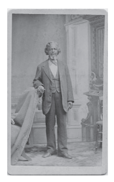
FIGURE 1.4 ► Benjamin "Pap" Singleton was a 37-yearold slave when he escaped to Detroit and began operating a secret boarding house for runaway slaves. After the Civil War ended, he returned to Tennessee and later began his work as a Moses-like figure, leading people to the promised land.

enforcement capability, agents on various reservations scrapped together funds and recruited Native Americans as police officers. The Congress finally began appropriating money for tribal police agencies in 1879 (see Figure 1.6).<sup>8</sup> Tribal enforcement agencies represent an out-of-the-mainstream example of American police administration, as is the U.S. Mint Police (1792).